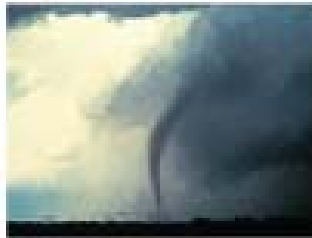
Spotter sees a tornado