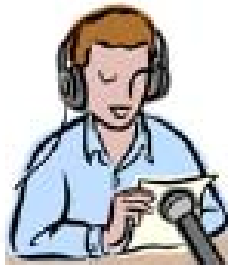
Amateur Radio Net Control