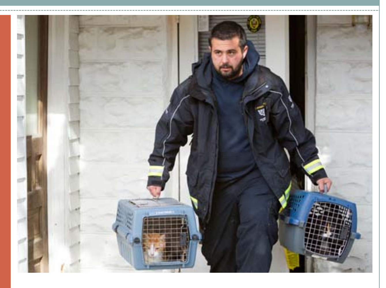
Continue Training Needs & Update Plans Often

Staying organized: signage, paperwork, ICS, protocol.